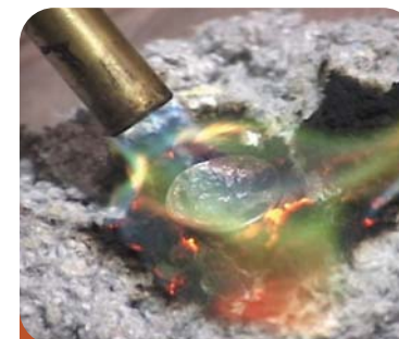
Under direct flame, a penny will melt before the Cellulose insulation burns

Cellulose insulation is easy and safe to install without all of the itching or non-recyclable waste.